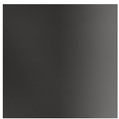
GLOSSY PAINTEDBRO WN NICKEL

FINISHINGS\STRUCTURE\GLOSSY PAINTEDBROWN NICKEL (1)